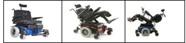
Fig 1.1 - Rhythm Power Chair with R-Net Controller shown with seating options.

Base package includes frame, standard wheels, casters, seat interface, standard electronics package. Client accessories and other options to alter chair performance are additional charge