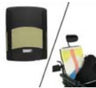
Fig 4: Jay SPO Back - includes foam customization kit. Takes up 1" seat depth