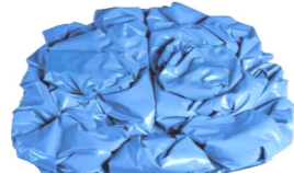
Factory Filled Fluid Insert