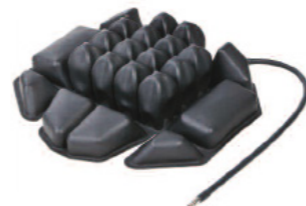
Air filled PLA Insert Single Chamber