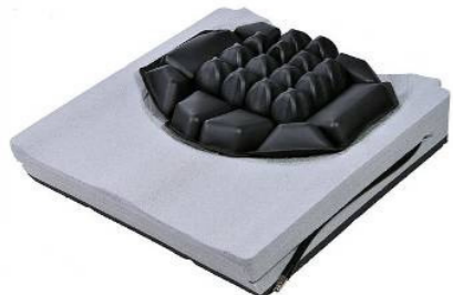
J3 cushion with Roho Air Cell Bladder