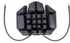
Air filled PLA Insert Dual Chamber