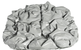
Field Variable Fluid Insert